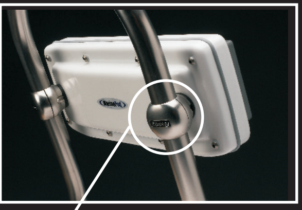
Option Edson stainless steel rail fittings make fitting a breeze. Cables can be securely routed through the fitting for a reliable waterproof connection.

MarinePod can be precut for most popular instruments and displays