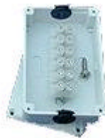
6WAY connector block included. Box size 65x55x30mm PARTNUMBER: ZINDJB1P